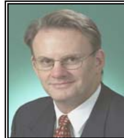
Mark Latham – Club member 1983-84

# Leader of the Opposition –Australian Labor Party. 2003-04