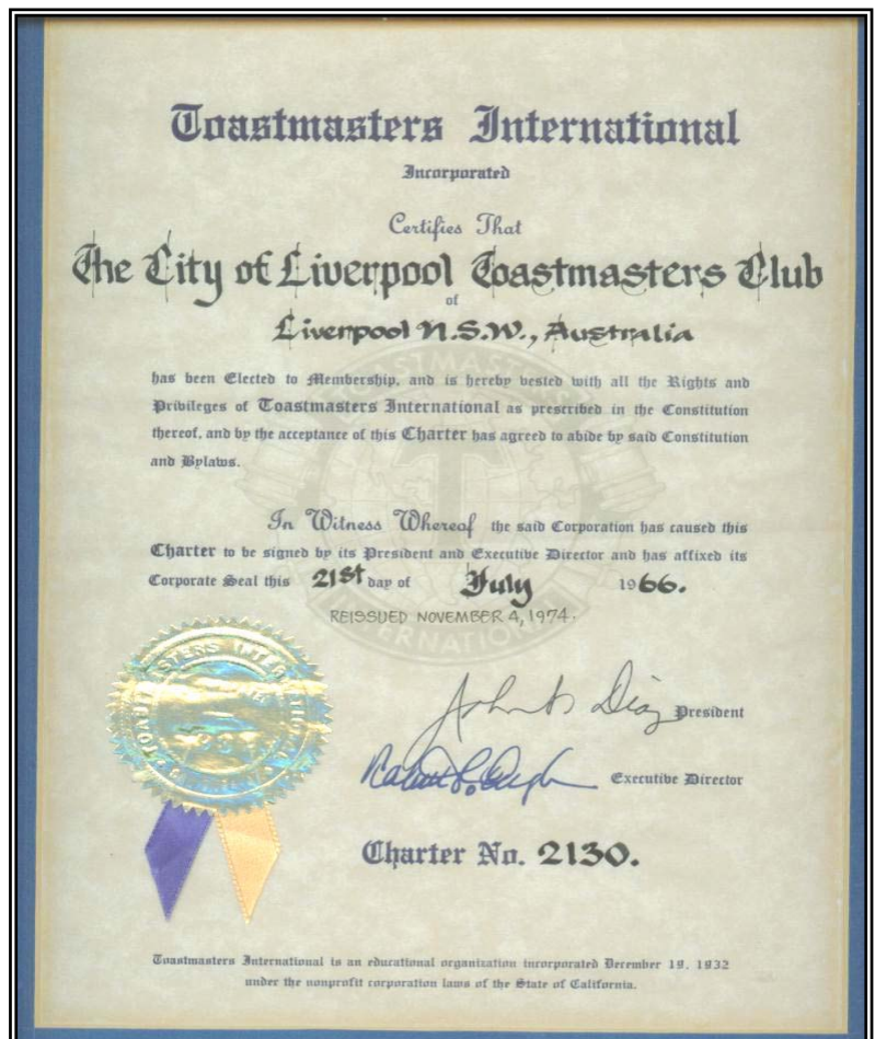
Charter Certificate – Club Chartered on the 21 st July, 1966